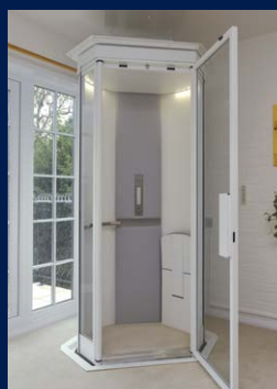
Lifestyle Home Lift

For further information or to book your free home survey, call us today on 0345 365 5366 or visit www.terrylifts.co.uk to view our full range of home lifts