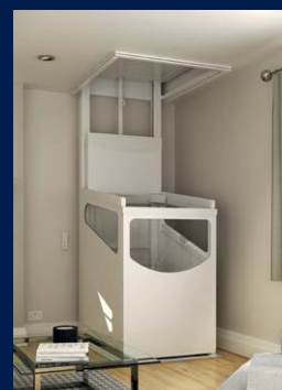
Harmony Home Lift