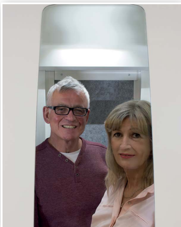
Full height glazed door