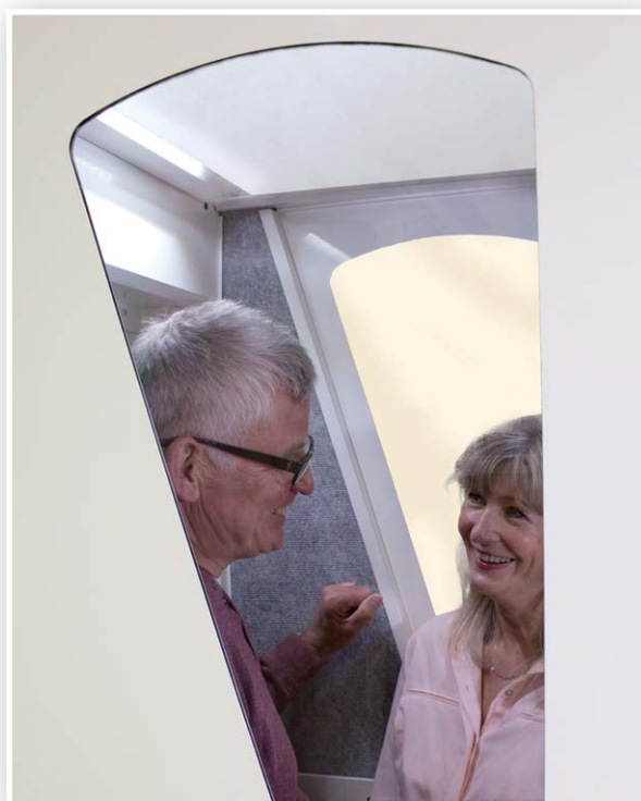
Glazed side panels