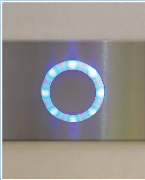
One-touch LED controls in the lift car and wireless call stations on both landings